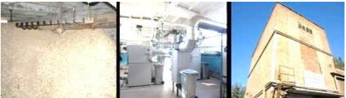
Fig 3. Methanation plant for bio-electricity production installed in Lucanian Dolomites of Basilicata