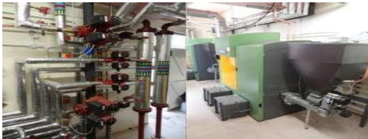
Fig 4. Wood chip based heating plant installed at School in Valli del Pasubio in Italy