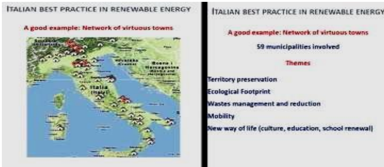
Fig 2. Good renewable energy practices in Italy