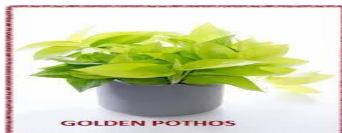
Fig 31. Golden Pothos or Devil's Ivy ( Scindapsus aureus )

It belongs to Arum family (Araceae) and it filters formaldehyde. It is hardy indoor foliage houseplant.