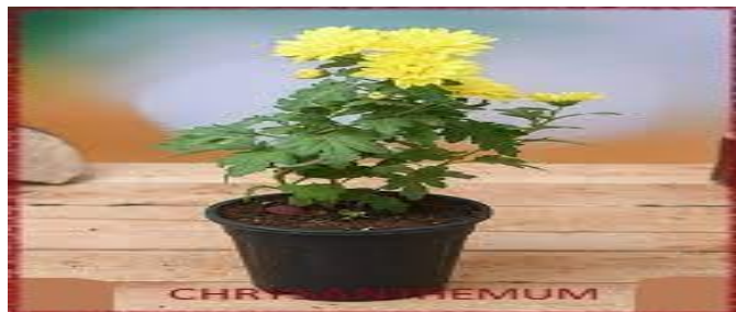
Fig 29. Chrysanthemum ( Dendranthema grandiflorum )

It is commonly known as Mums of Chrysanth. One of the most popular outdoor flowering plants categorized under the family Asteraceae. It was found to be one of the most effective plants which remove and cleaning ammonia, benzene, formaldehyde, trichloroethylene, xylene, toluene and several other known pollutants from the air.