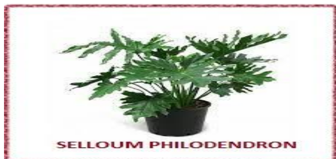
Fig 20. Lace Tree Philodendron ( Selloum philodendron )

Selloum philodendron is species under genus Philodendron categorized in the plants family Araceae, famous for listing outstanding low light houseplants. It is commonly known as Lace Tree Philodendron. It is found to be effective in cleaning formaldehyde.