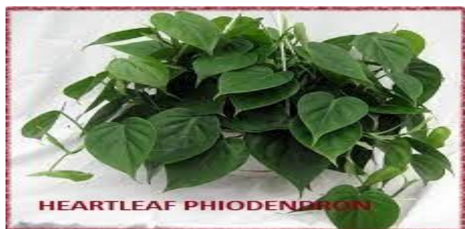
Fig 19. Heartleaf Philodendron ( Philodendron hederaceum )

Heartleaf Philodendron is famous for listing outstanding low light houseplants. It species under genus Philodendron categorized in the plants family Araceae, it is found to be effective in cleaning formaldehyde only.