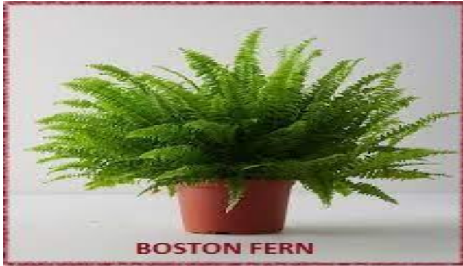
Fig 10. Boston Fern ( Nephrolepis exaltata )

Boston fern is a species of genus Nephrolepis in the Nephrolepidaceae family, which is native to humid forests and swamps. It is effective in removing and cleaning formaldehyde, xylene, toluene and airborne germs, molds, bacteria's from the indoor air.