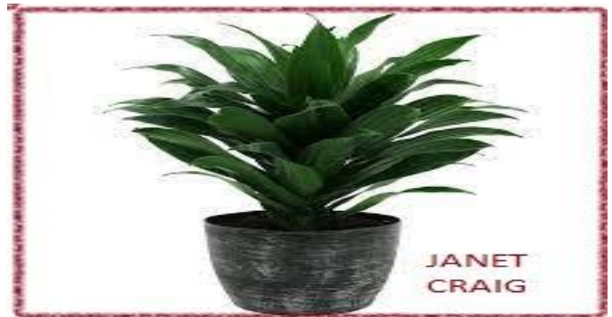
Fig 13. Janet Craig ( Dracaena deremensis )

Dracaena deremensis is one of the popular houseplants; it is a species from Dracaena genus counted under Asparagaceae plants family. It is hardy to adverse weather conditions and suits to grow indoors. It is effective in cleaning benzene, formaldehyde and rated as one of the best plant for removing trichloroethylene pollutants from the air.