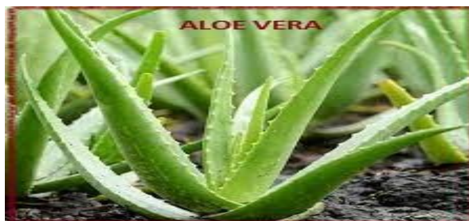
Fig 8. Aloevera ( Aloe vera )

Aloe vera is a succulent plant species of the genus Aloe categorized under plants family Asphodelaceae, it is one of the most amazing plants, which are beneficial for a multitude of problems, and it has been used for medicinal purpose from ancient times. It is very hardy to adverse weather conditions and suits to grow in bright light and deserts. It is effective in cleaning formaldehyde and benzene.