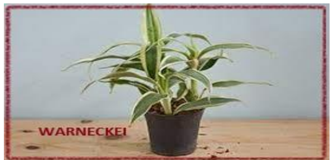
Fig 14. Striped Dracaena (Warneckii) ( Dracaena fragrans )

Dracaena deremensis 'Warneckii' is another popular white stripes houseplants, it is counted under Asparagaceae plants family. It is hardy to adverse weather conditions and suits to grow indoors. It is effective in cleaning formaldehyde, benzene and trichloroethylene chemicals from the air.