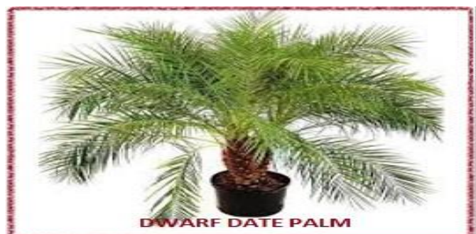
Fig 28. Dwarf Date Palm ( Phoenix roebelenii )

It is a species of date palm categorized under the family Areaceae, native to Southeastern Asia. It is effective in cleaning formaldehyde, xylene and toluene pollutants.