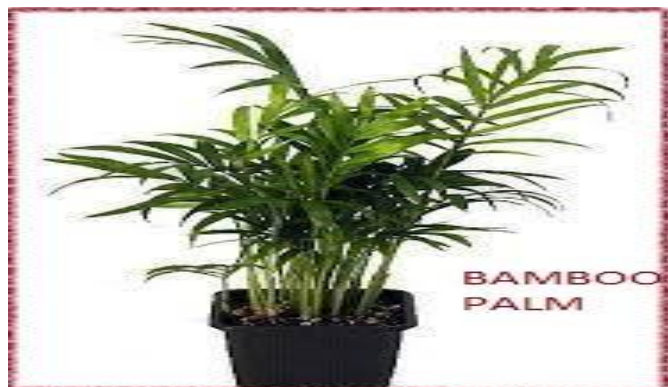
Fig 5. Bamboo Palm ( Chamaedorea seifrizii )

Bamboo palm is categorized under plants family Araceae, also called the 'reed palm'. Plant likes to grow under shade and humid conditions under tree in rain forests. It is effective in cleaning trichloroethylene, benzene, formaldehyde, xylene and toluene from the air.