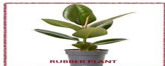
Fig 22. Rubber Plant ( Ficus robusta )

Rubber fig plant is species under genus Ficus categorized in the plants family Moraceae, native to South Asia. The plant is found to be effective in removing formaldehyde from indoor air.