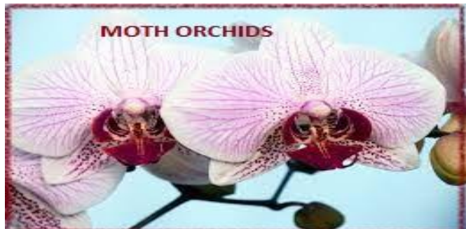
Fig 26. Moth Orchids ( Phalaenopsis )

Orchids are ever-popular indoor potted plants and adapt to different types of environments, which is one of the reasons they are popular and so easy to maintain. They help in removing many small microorganisms and indoor pollutants from the air.