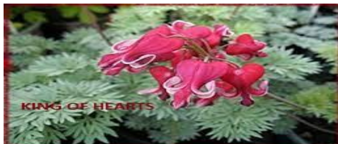
Fig 25. King of Hearts ( Lamprocapnos spectabilis )

King of Hearts is a flowering plant with fern-like leaves and an inflorescence of drooping pink, purple, yellow or cream flowers. It is a species of genus Dicentra categorized under the plants family Papaveraceae, native to the North America. The plant is found to be effective in cleaning xylene and toluene from the air.