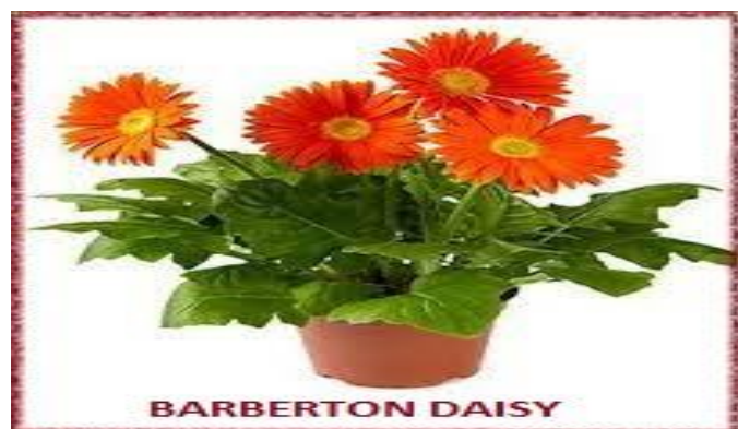
Fig 16. Barberton Daisy ( Gerbera jamesonii )

'Gerbera' is one of the most popular plants with diverse colored shining flowers; it is a genus of flowering plants family Asteraceae (daisy family). The plant is hardy to adverse weather conditions and suits to grow in bright light. It is effective in cleaning benzene, formaldehyde and trichloroethylene VOCs from the air.