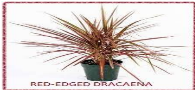
Fig 32. Red- Edged Dracaena ( Dracaena marginata )

It belongs to Asparagus family and filtering out xylene, trichloroethylene and formaldehyde, typically found in lacquers, varnishes and gasoline.