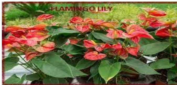
Fig 7. Flamingo Lily ( Anthurium andraeanum )

Anthurium is popular gift plant; it is a species in the plants family Araceae, native to Colombia and Ecuador. Anthurium has heart shape shiny green leaves and beautiful flowers, which last for several months after bloom. It is effective in removing formaldehyde, ammonia, xylene and toluene from the air.