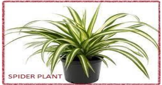
Fig 12. Spider Plant ( Chlorophytum comosum )

It is an herbaceous perennial houseplant; falls in Asparagaceae plants family, native to Southern Africa. It is popular easy care, elegant and fast growing houseplant. It is one of the top varieties plant for removing VOCs. Spider plant found to clean formaldehyde, toluene and xylene.