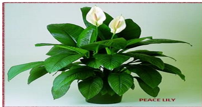
Fig 3. Peace Lily ( Spathiphyllum wallisii )

One of the popular indoor plants belongs to Araceae family. It was found to be one of the most effective plants, which remove alcohol, ammonia, formaldehyde, benzene, trichloroethylene, xylene pollutants. Xylene is used as a solvent in the printing, rubber and leather industries.