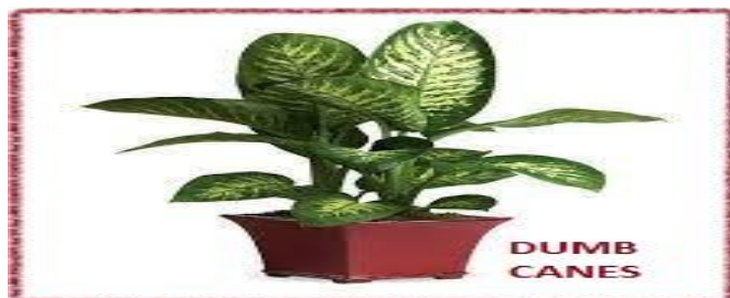
Fig 24. Dumb Canes ( Dieffenbachia seguine )

Leopard lily is a genus of tropical flowering plants in the family Araceae, native to the Mexico. It is found to be effective in cleaning xylene and toluene chemicals from the air.