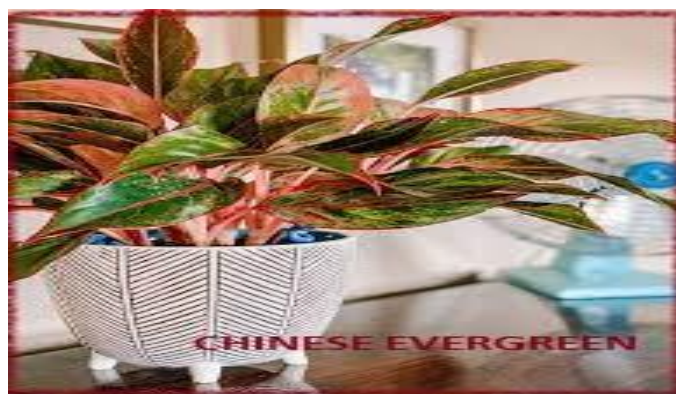
Fig 18. Chinese Evergreen ( Aglaonema commutatum )

Aglaonema is popular indoor plants comes from Arum plants family araceae which is native to tropical and subtropical regions of South Asia. It is found to be effective in cleaning benzene and formaldehyde pollutants.