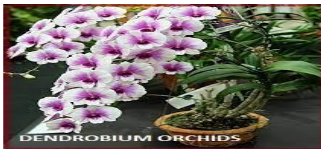
Fig 23. Dendrobium Orchids ( Dendrobium nobile )

Pigeon orchids are ever-popular indoor potted plants belongs to family Orchidaceae and adapt to different types of environments, which is one of the reasons they are popular and so easy to maintain. It also called cane orchids; they have smaller flowers of typically white or purple color that grow in rows stalks that arise from thick canes.