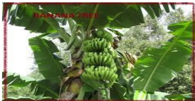
Fig 27. Banana Tree ( Musa paradisiaca )

Banana is a large herbaceous flowering outdoor plant belongs to Musaceae family, native to tropical Indomalaya and Australia. It is found to be effective in cleaning formaldehyde from the air.