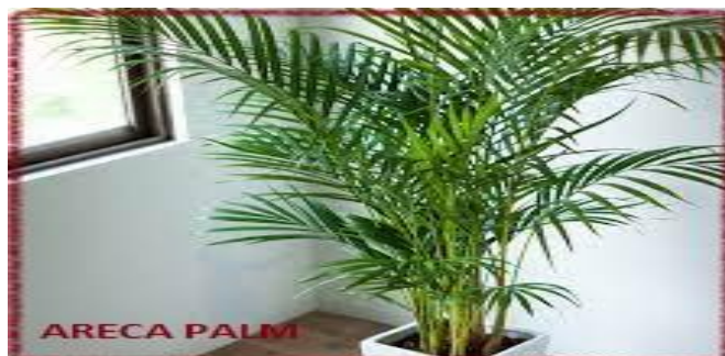
Fig 9. Areca Palm ( Chrysalidocarpus lutescens )

It is a species of flowering plant in the Araceae family, native to Madagascar. They also called as 'Butterfly palm'. It is one of the most popular foliage houseplants, which are effective in cleaning formaldehyde, xylene and toluene. Toluene most commonly found in glues, nail polish remover, paints thinner and correction fluid.