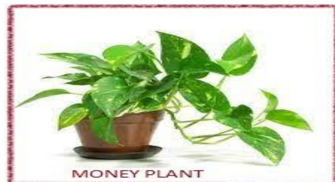
Fig 6. Money Plant ( Epipremnum aureum )

It is one of the most common houseplants and commonly called golden pothos, devil's ivy etc. It is a species of the plant family Araceae. It is effective in cleaning formaldehyde, benzene, trichloroethylene, xylene and toluene from the air. Money plant is one of the hardiest plants, which do well in most of the indoor environmental conditions.