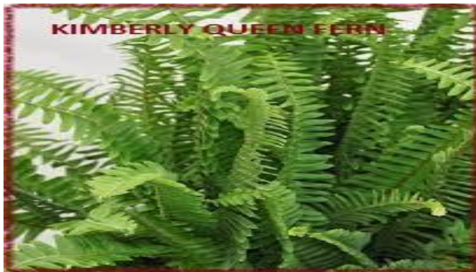
Fig 11. Kimberly Queen Fern ( Nephrolepis oblitterata )

It is native to humid forests and swamps and species of genus Nephrolepis in the family Nephrolepidaceae. It is effective in removing airborne germs, molds, bacteria's, formaldehyde, xylene, toluene from the indoor air. It is one of the hardiest houseplants, which are identical to Boston fern except it has upright growing habit.