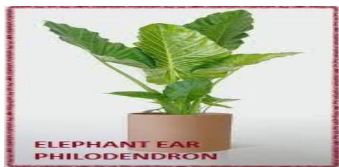
Fig 21. Elephant Ear Philodendron ( Alocasia macrorrhizos )

It is species under genus Philodendron categorized in the plants family Araceae, famous for listing outstanding low light houseplants. It is found to be effective in cleaning formaldehyde only.