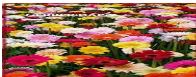
Fig 30. Gerbera Daisy ( Gerbera spp. )

It belongs to family Asteraceae and commonly known as 'Transvaal or Barberton daisy'. It is very effective to remove trichloroethylene chemical typically found on dry cleaning. It also filters benzene and improves sleep by giving oxygen while observing carbon dioxide.