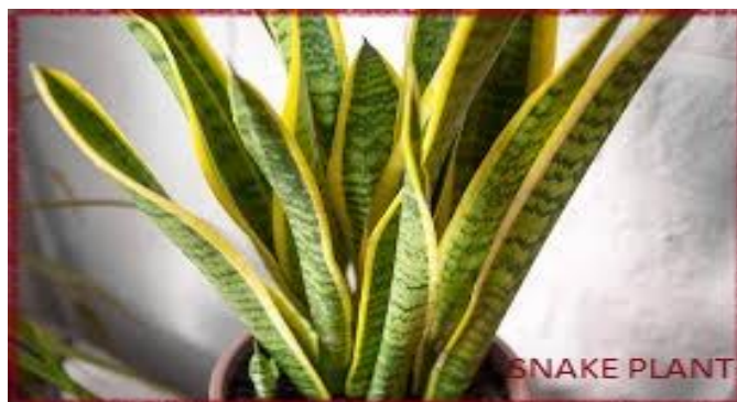
Fig 4. Snake Plant ( Dracaena trifasciata )

Its other name is 'Sansevieria' belongs to Asparagaceae family; one of the hardiest and a perfect indoor plant which does not require bright or sun light as well as frequent watering. It was found to be one of the most effective air purifier plants, which remove benzene, formaldehyde, trichloroethylene, xylene and toluene from the air.