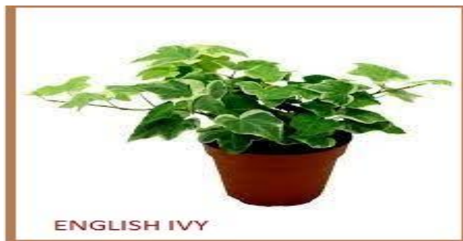
Fig 17. English Ivy ( Hedera helix )

English Ivy is one of the most popular indoor vine plants in Europe; it is a species of flowering plant in the family Araliaceae, native to most of Europe and western Asia. It was found to be one of the most effective plants, which remove VOCs such as benzene, formaldehyde, trichloroethylene, xylene and toluene from the air.