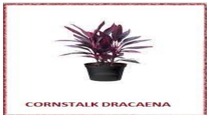
Fig 15. Cornstalk Dracaena ( Dracaena fragrans )

Dracaena fragrans 'Massangeana' is other common and popular houseplants, counted under Asparagaceae plants family. It is also hardy to adverse weather conditions and suits to grow indoors. It is effective in cleaning benzene, formaldehyde and trichloroethylene VOCs from air.